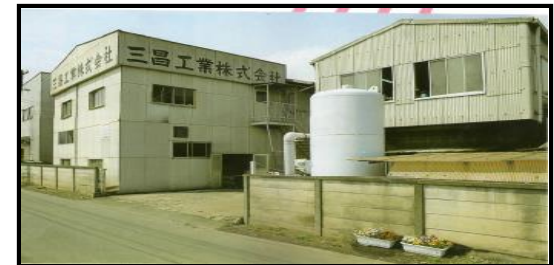
Sansho Kogyo Plant 4