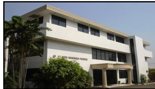
PT. Duta Nichirindo Pratama