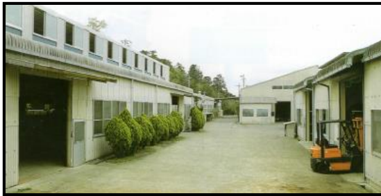
Sansho Kogyo Plant 1