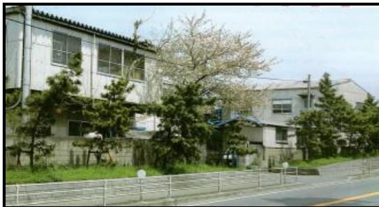
Sansho Kogyo Plant 3