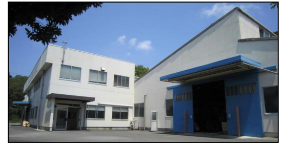
Sansho Kogyo Plant 2